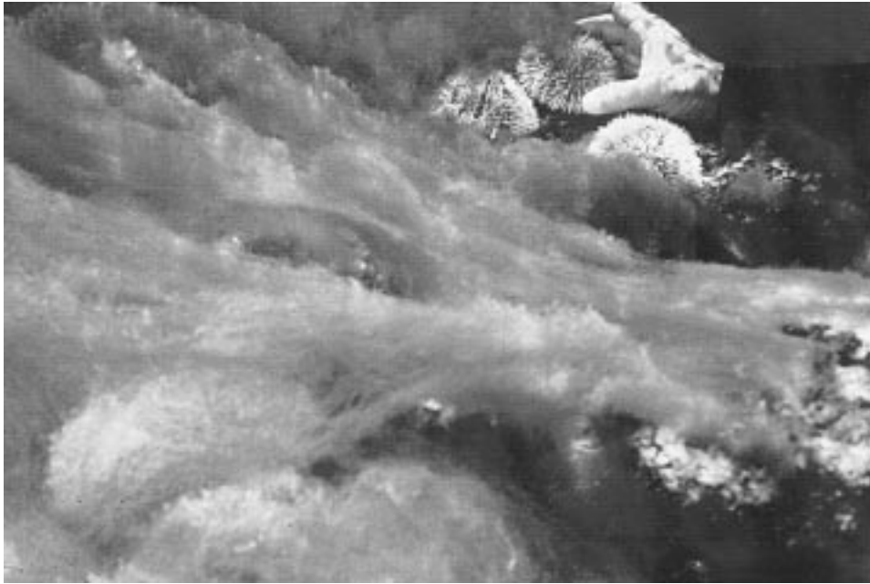
Fig. 2. Bloom (up to 1.5 m deep, ~3-ha area) of macroalgae ( C. linum and Lyngbya sp.) overgrowing fore reef communities on fringing reefs in the Negril Marine Park offshore Orange Bay, Jamaica, August 1998, following the onset of the summer wet season. During the past decade, macroalgal blooms like this have become increasingly common on Jamaican fringing reefs adjacent to nutrient inputs from sewage or agricultural runoff. Note the browsing sea urchin Tripneustes ventricosus that is normally found in more nutrient-rich seagrass meadows in the back reef along Jamaica's north coast. The recent expanded distribution of this urchin has followed the development of macroalgal blooms, suggesting cascading trophic responses to nutrient enrichment on these formerly coral-dominated fore reef communities.

areas of the Caribbean did not experience the macroalgal blooms and coral loss seen in Jamaica following Diadema die-off. Liddell and Olhorst (1992) concluded that a combination of reduced grazing and eutrophication was most likely fueling the increased macroalgal cover on shallow reefs in Jamaica, consistent with my previous conclusion (Lapointe 1997). That view is further supported by Goreau (1992), who reported that "algal overgrowth of corals is a seriously escalating problem in most Jamaican reefs . . . due to a combination of reduced herbivory and to increased fertilization by nutrients derived from inappropriate land and sewage management practices" (Fig. 2).